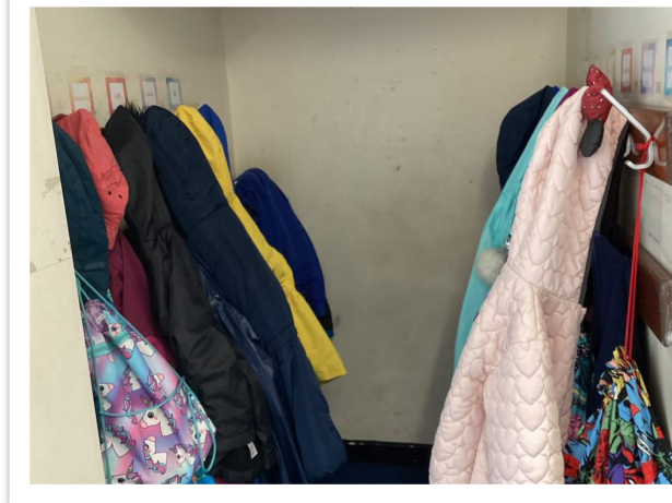
This is where you will hang your coat and bookbag.