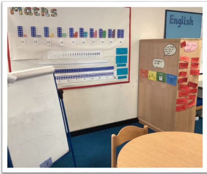
This is the area outside of Year 2 where you may sometimes work.