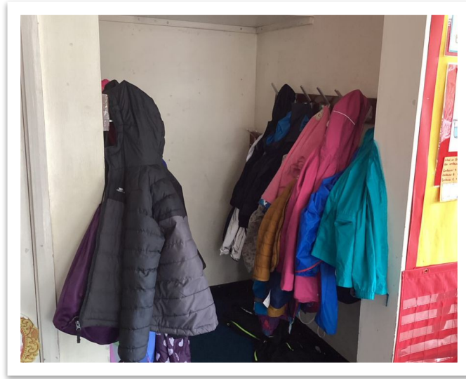
This is where you will hang your coat and bookbag.