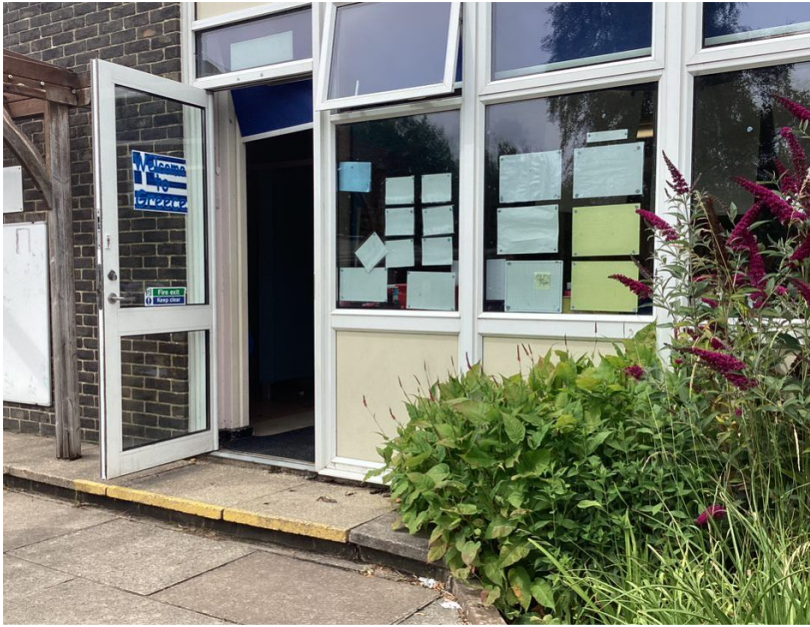
This is where you will enter the school and your classroom.