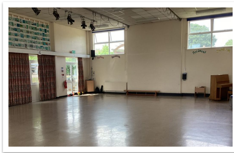
These are the KS1 & KS2 Halls where you will have lunch and assemblies.