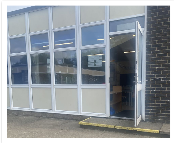
This is where you will enter the school and your classroom.