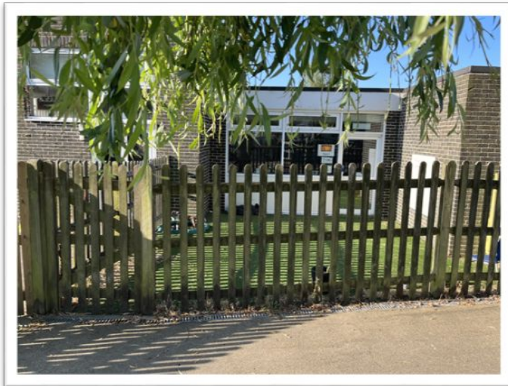
This is where you will enter the school and your classroom.