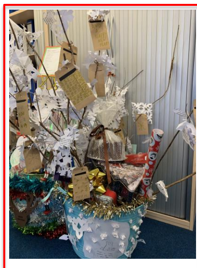
BEST TRUG WINNERS Congratulations RUSSIA

Whilst the children were busy decorating and filling their trugs, the BPSCA team got to work selling raffle tickets through book bags, at school drop off, before the Christmas performances and even to anyone willing to purchase one as they left the school's polling station on 12 th December.